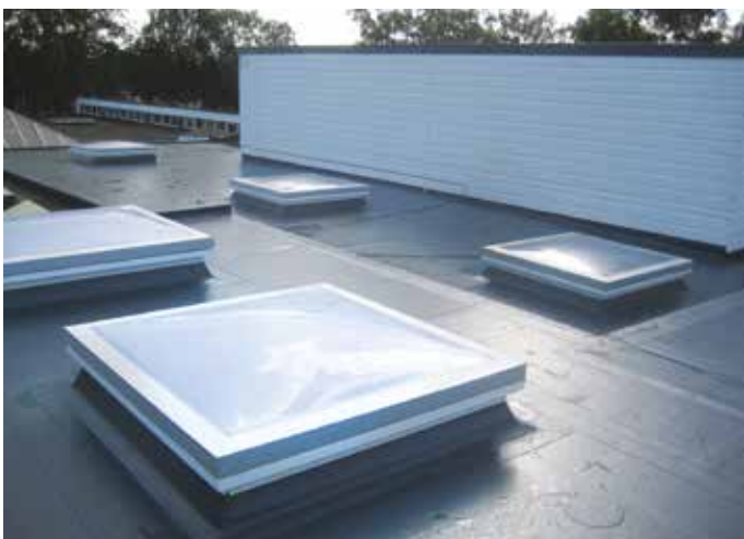
LODDEN SCHOOL MARDOME ULTRA