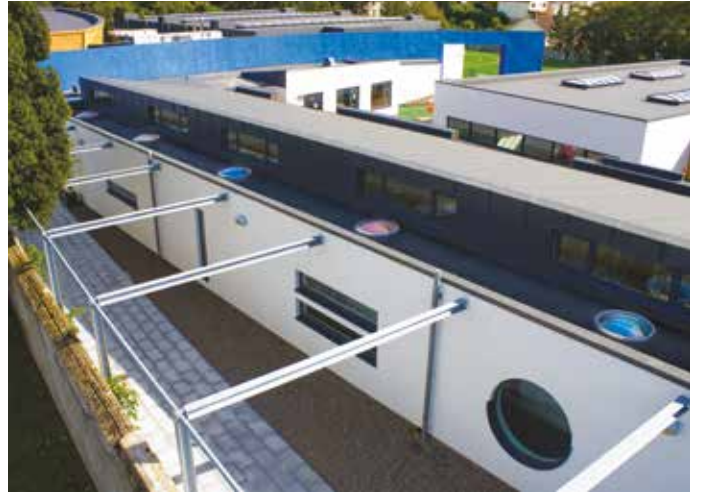
CASTLE PARK SCHOOL MARDOME CIRCULAR