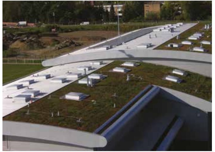
HOE VALLEY COMMUNITY CENTRE MARDOME ULTRA