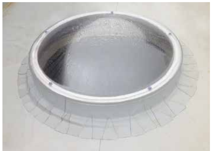
KEMBALL SCHOOL MARDOME CIRCULAR