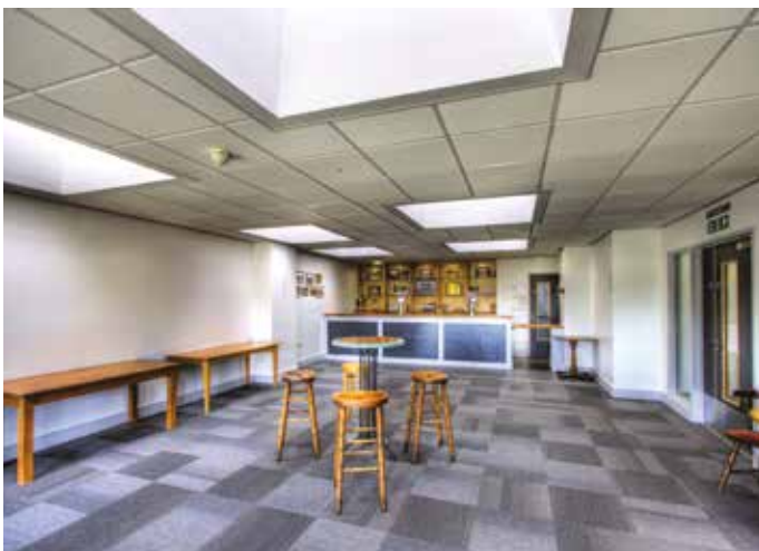
WESTFIELD FOOTBALL CLUB MARDOME ULTRA