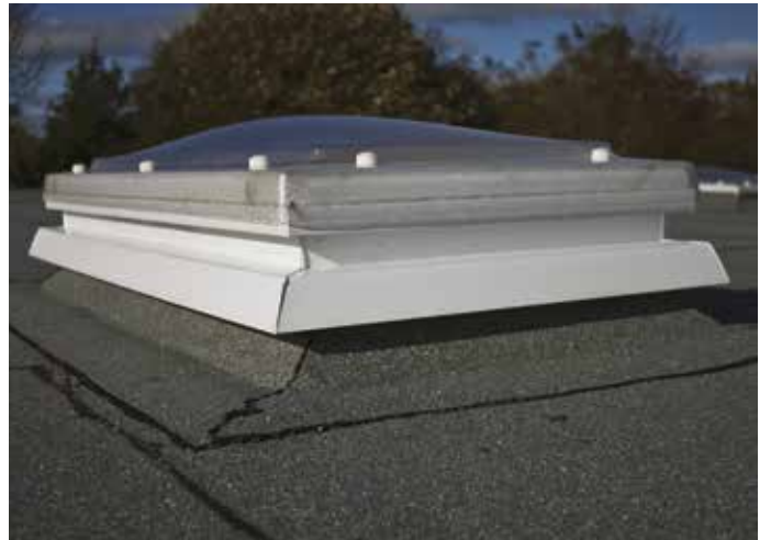
SCOIL BHRIDE PRIMARY SCHOOL MARDOME TRADE